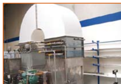
Green/Environmental Winner Creative Water Technology