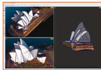
People's Choice Winner VideoTrace