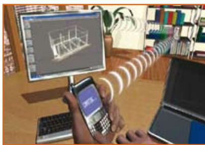
Innovation Excellence Winner Gigabit Wireless Transceiver on CMOS