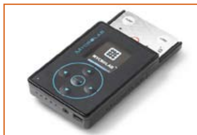
Winner Handheld Medical Diagnostic System