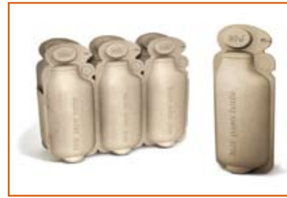
International Winner 360 Paper Water Bottle