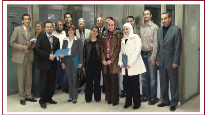
Participants at the course

This course is part of a series of tools presented by AKMS