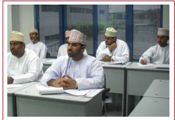
A number of the participants at the program

Meanwhile, under the supervision of AKMS, the Arab Omani Institute's administration, in collaboration with the Oman Chamber of Commerce and Industry, is engaged in organizing a specialized lecture