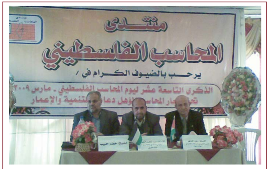
Speakers at the Ceremony