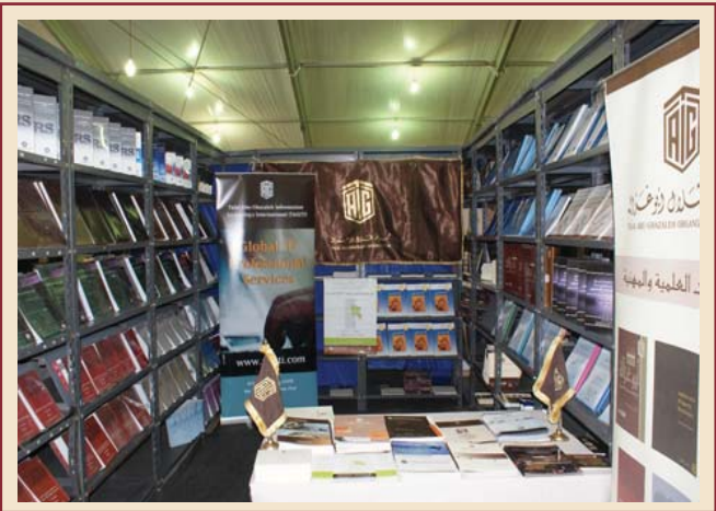
TAG-Org booth at the Alexandria International Book Fair

The Book Fair dedicated a special booth for used publications, the first editions of the old educational Arabic magazines, rare editions of books issued in the nineteenth century in Egypt in addition to Arabic books