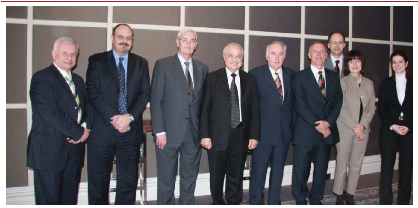
Mr. Talal Abu-Ghazaleh and Prof. Dr. Wolfgang Boehmer at the meeting

A MMAN - Mr. Talal Abu-Ghazaleh, chairman and CEO of Talal Abu-Ghazaleh Organization (TAG-Org) discussed with the Minister-President of the German Federal State of Saxony-Anhalt Prof. Dr. Wolfgang Boehmer mutual cooperation between the two parties in various fields.