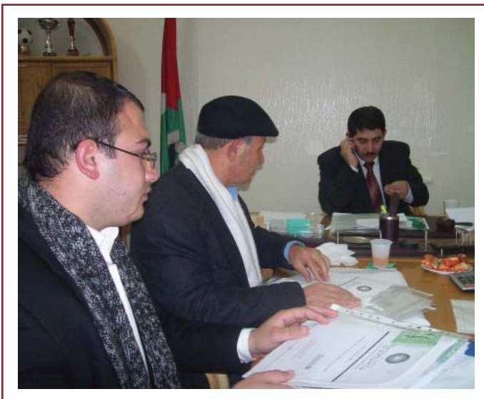
Selecting the applications