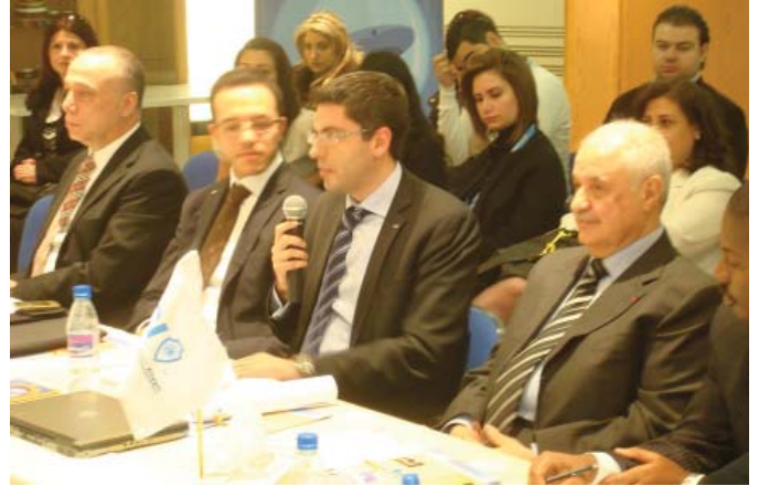
Participants at the lecture