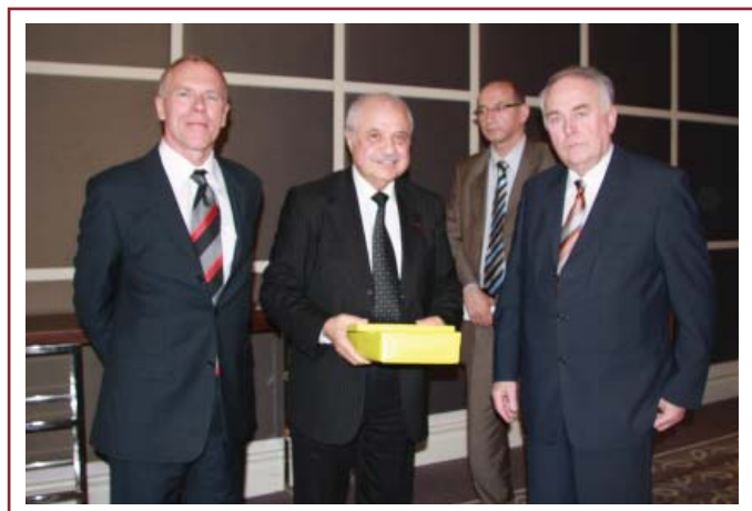
The German Federal State of Saxony-Anhalt Prof. Dr. Boehmer presents an honorary gift to Mr. Abu-Ghazaleh

A MMAN - Mr. Talal Abu-Ghazaleh, chairman and CEO of Talal Abu-Ghazaleh Organization (TAG-Org) discussed with the Minister-President of the German Federal State of Saxony-Anhalt Prof. Dr. Wolfgang Boehmer mutual cooperation between the two parties in various fields.