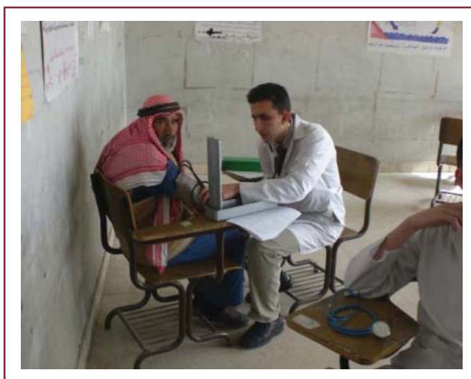
A medical examination for a citizen in Al Khlidyah region

Further, several lectures were delivered and focused on promoting awareness on various types of cancer and in particular breast cancer.