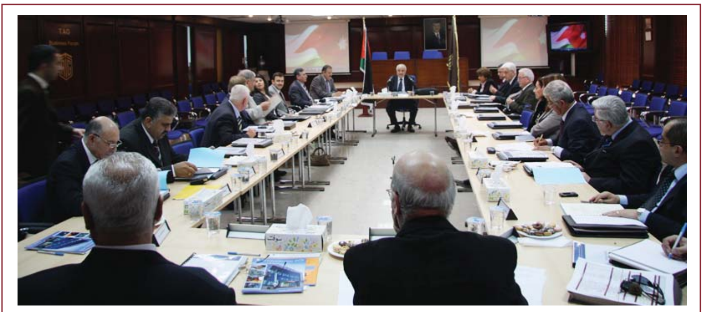
TAG-College Advisory Board Meeting