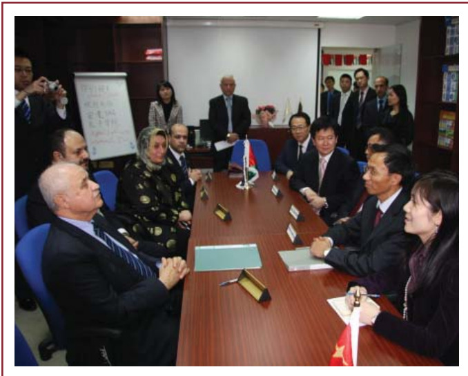
Abu-Ghazaleh and the Chinese ambassador in a meeting

guage courses for non-native speakers, while hosting researchers and language instructors from China for this purpose, in addition to offering lectures and workshops for businesspeople and governmental sector representatives, which aim to enhance cultural knowledge and exchange.