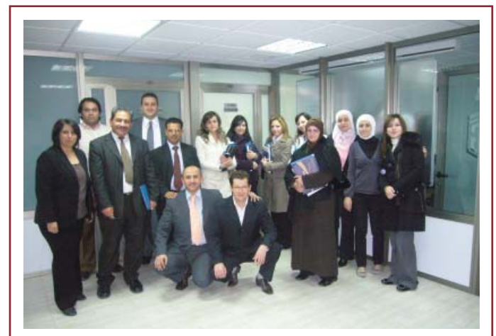
Participants at the course

This course is part of a series of tools presented by AKMS within its training programs for 2009 which include various courses in administrative subjects specifically in the field of quality management, project management, human resources administration, communication and administrative skills for new managers and other significant administrative courses.