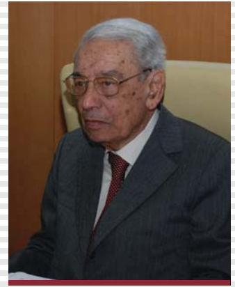
Dr. Boutros Boutros-Ghali