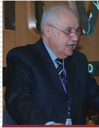
Mr. Talal Abu-Ghazaleh