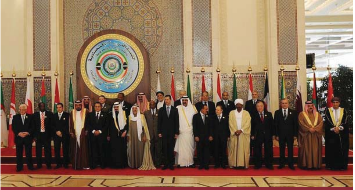
State of Kuwait - January 20, 2009

"We, the leaders of the Arab countries who held the Arab Economic, Development, and Social Summit in the State of Kuwait Muharram 22 and 23, 1430 Hegira, corresponding to January 19 and 20, 2009, stress the close ties and joint goals of the Arab homeland. We also work to entrench, bolster, and steer these goals in a way that will develop the entire Arab societies, repair their situation, and secure their future based on modern, genuine Arab economic thought in compliance with the League of Arab States' Charter and the agreements concluded within the framework of the Arab League and the adopted strategies.